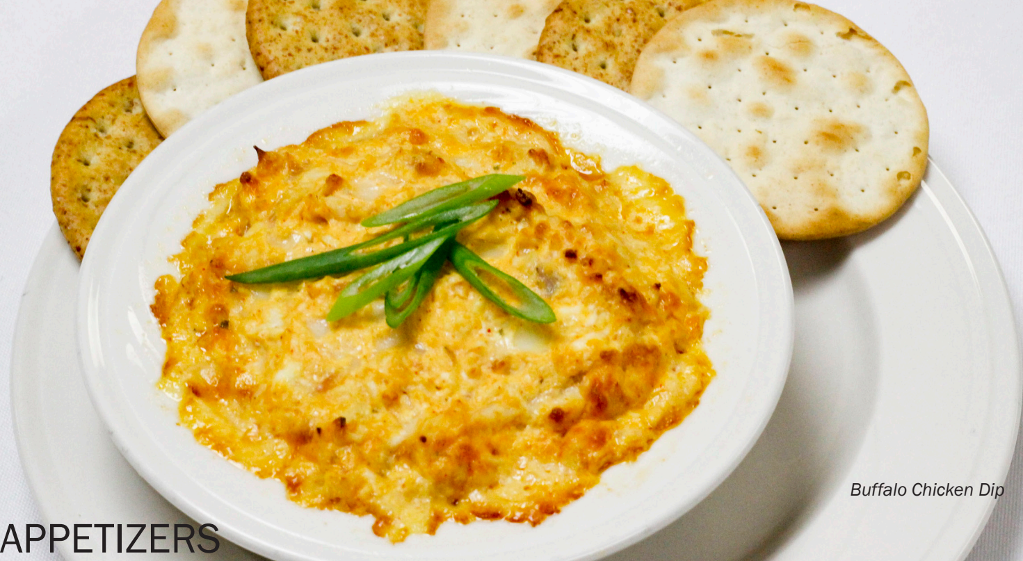
Buffalo Chicken Dip