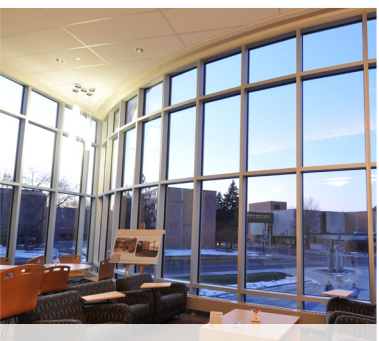
Terrace & Overlook