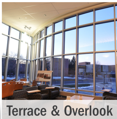
Terrace & Overlook