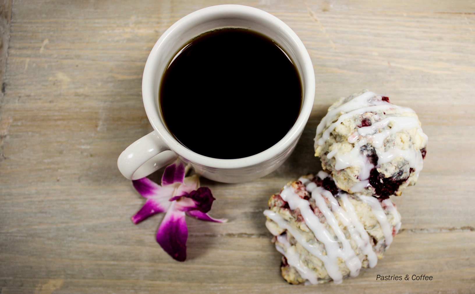
Pastries & Coffee