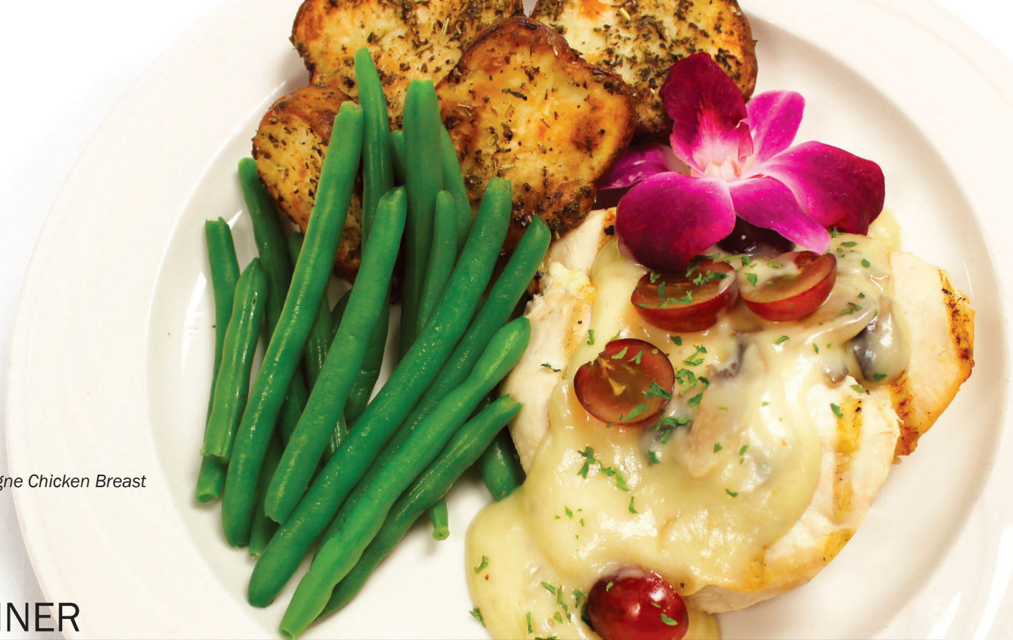
Champagne Chicken Breast