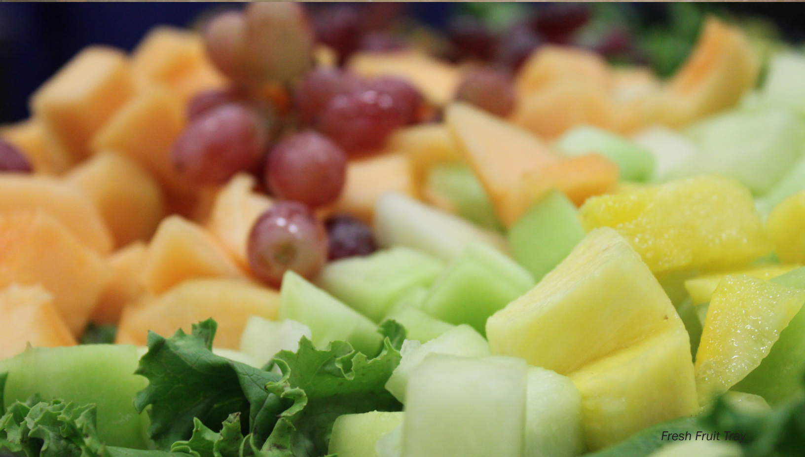
Fresh Fruit Tray