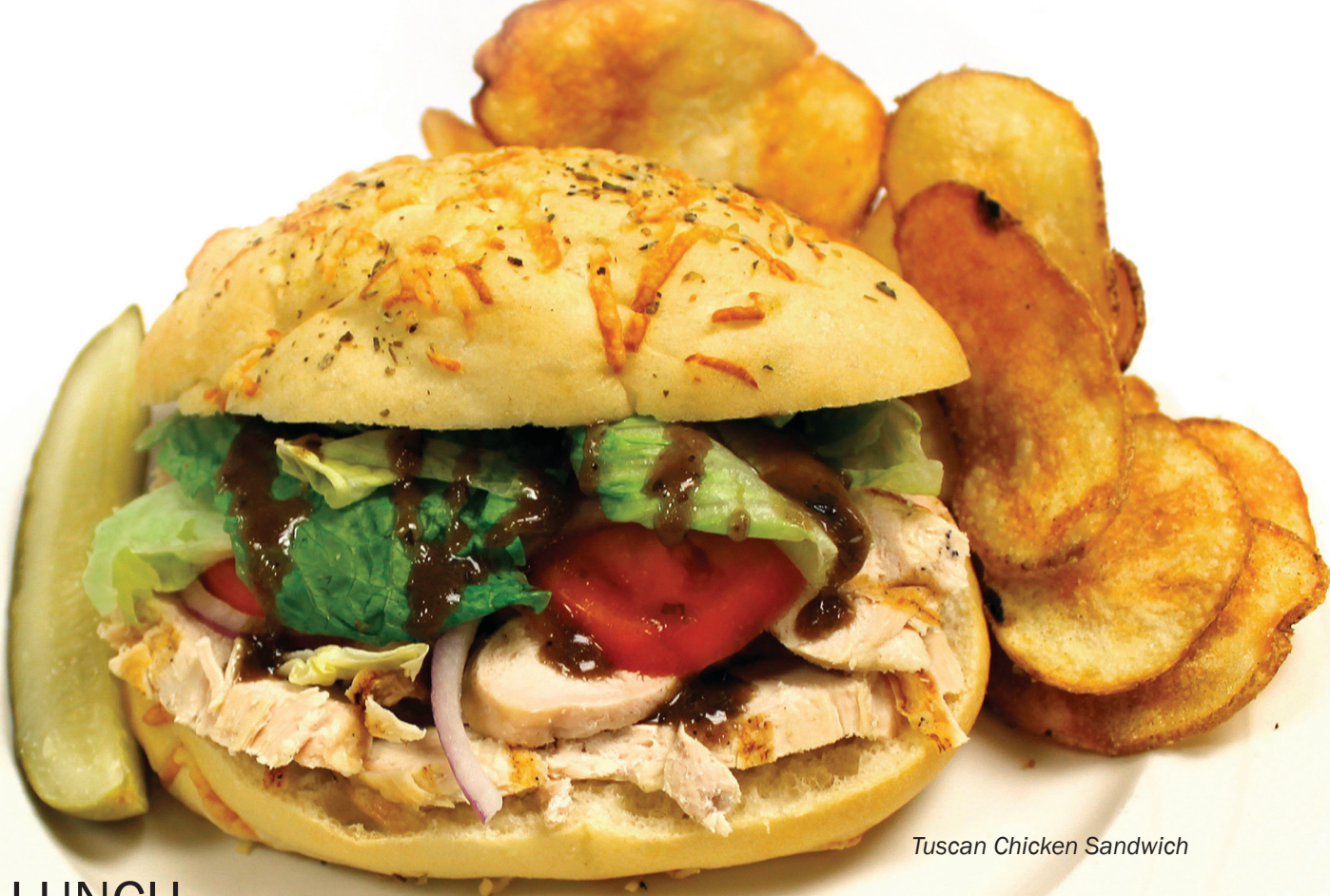
Tuscan Chicken Sandwich