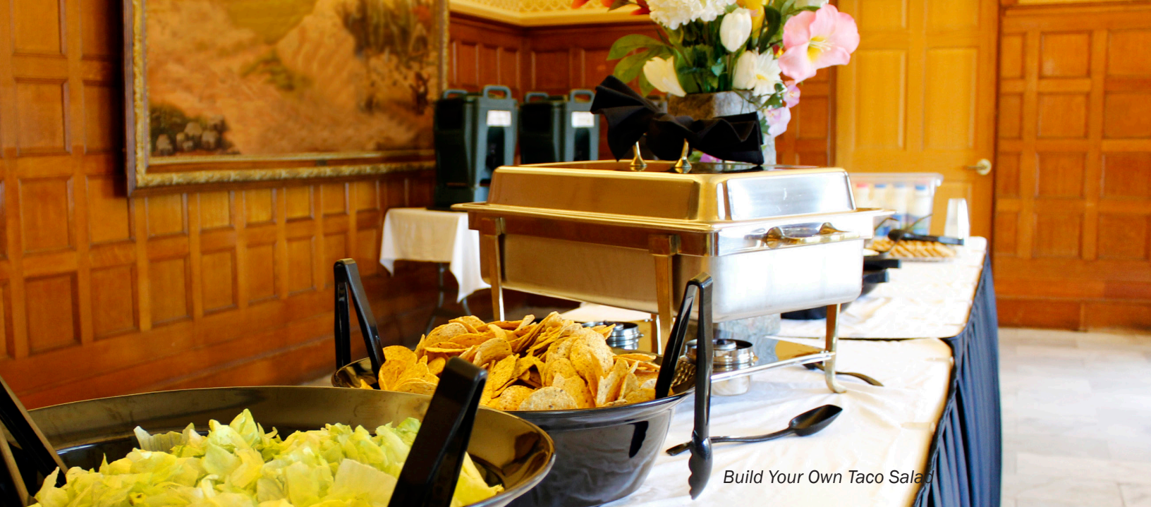
Build Your Own Taco Salad