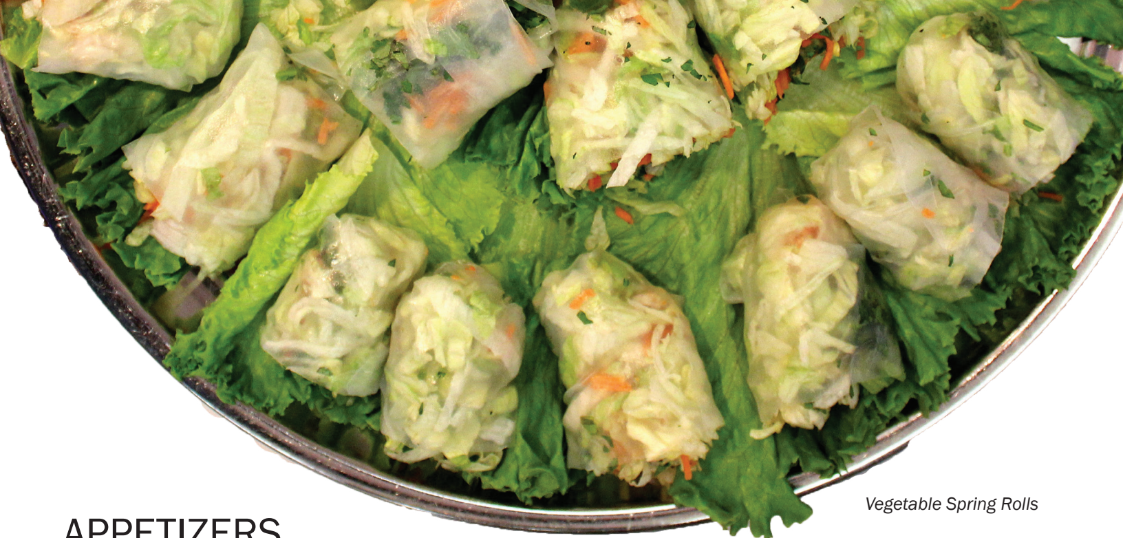
Vegetable Spring Rolls