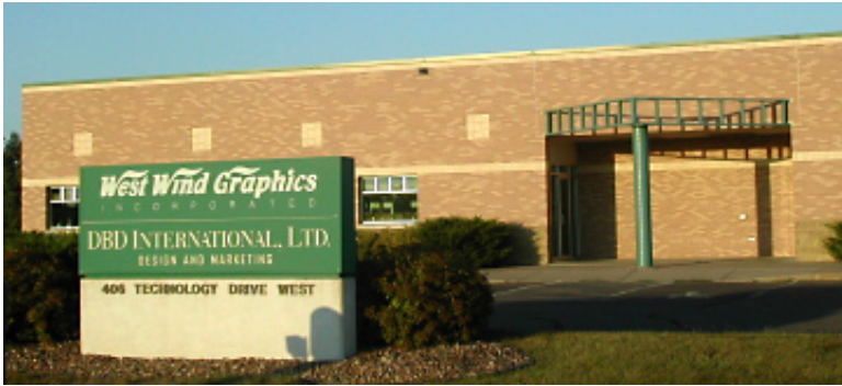
West Wind Graphics location in the Stout Technology Park