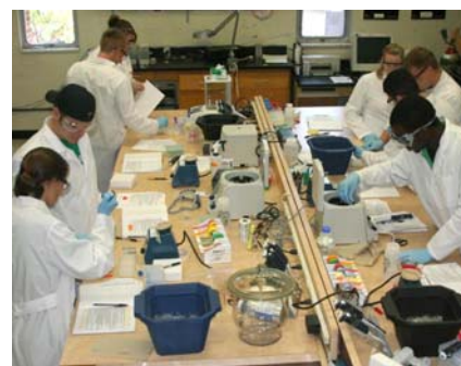
BIO-370, Fall 2007

was coming from, and we realized that a technique called "stable isotope analysis" would help me do so. To accomplish this goal, I accompanied Dr. Nold on a sampling trip in June. An entire week of full work days was spent on field work, collecting all sorts of samples: sediment cores, water samples, and bacterial mat samples.