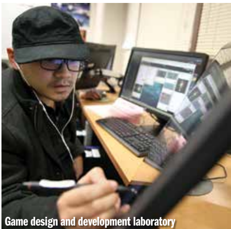
Game design and development laboratory

Total Degrees Available for Employment Minorities in program Males in program Females in program Employed Related to Major Employed Unrelated to Major Continuing Education Seeking Employment Percent Employed or Continuing Education Average Salary K-$1,000