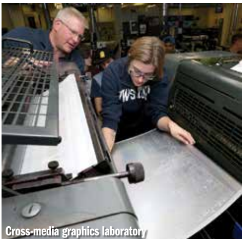
Cross-media graphics laboratory