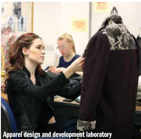
Apparel design and development laboratory