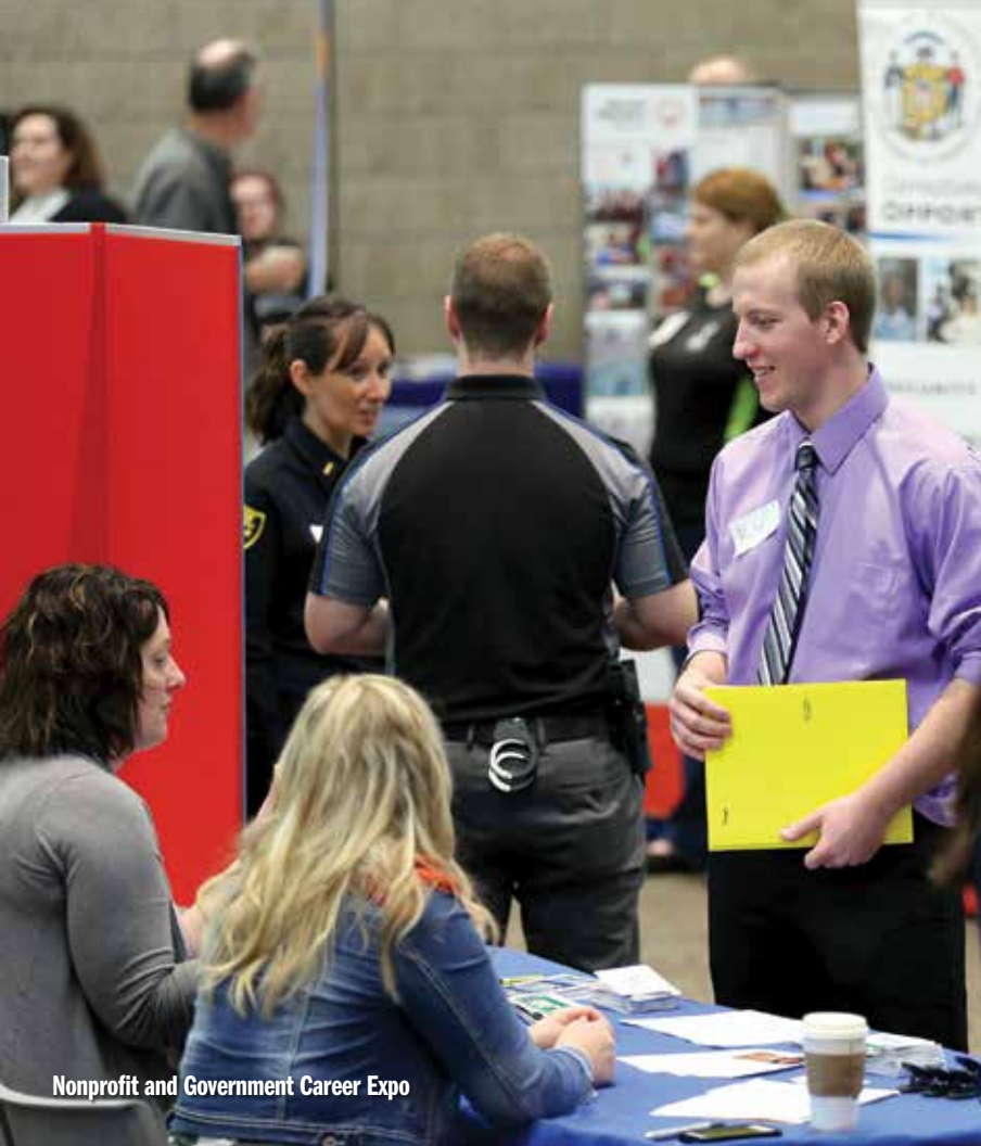
Nonprofit and Government Career Expo