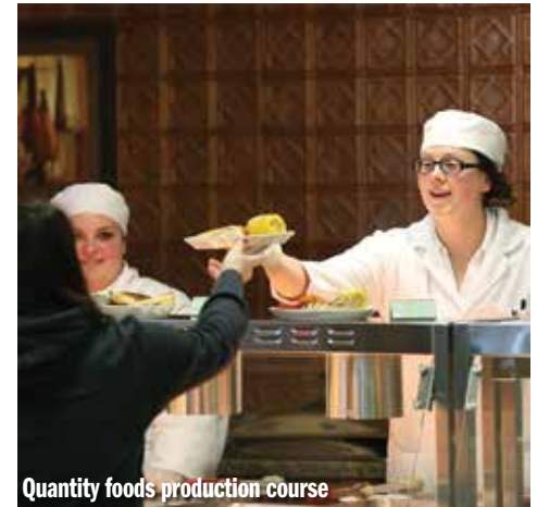
Quantity foods production course

The closing date to contact graduates for this report was 1/31/17.