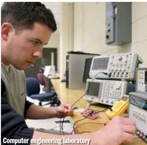
Computer engineering laboratory