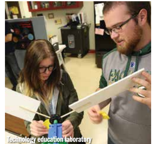
Technology education laboratory