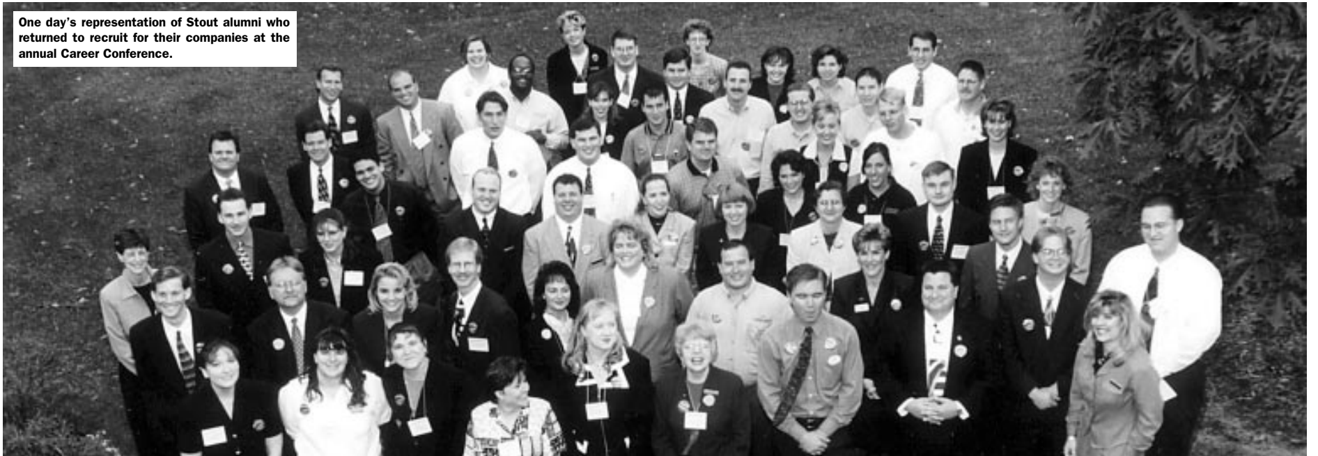
One day's representation of Stout alumni who returned to recruit for their companies at the annual Career Conference.