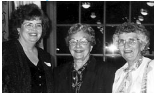
New friends and old acquaintances were made at the Port Washington gathering in September.