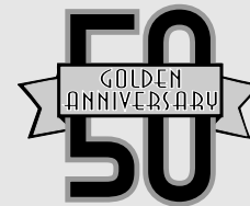
Classes of '47, '48, '49

Hear the latest developments at the Tech Park and see the "Super Computer" in action.