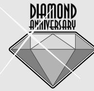
Classes of '30 through '39