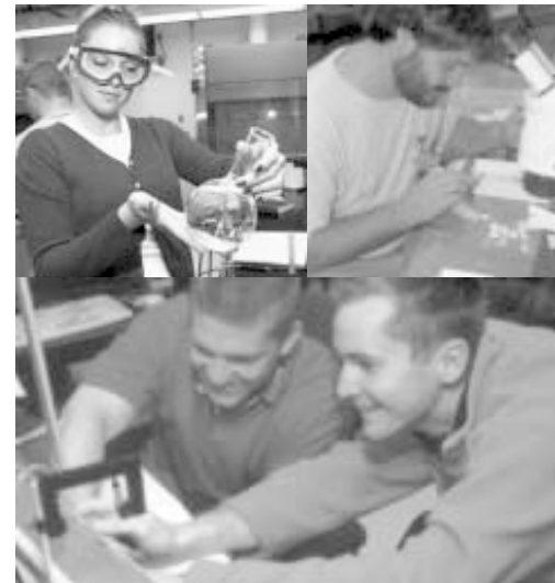
The curriculum of Stout's new applied science program is based on a core of chemistry, physics and biology.

"This program will benefit students and the state economy by providing job skills that are in great demand by high-tech industries."